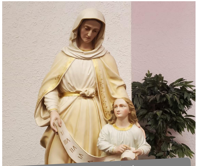
Ascension of the Lord May 29 th , 2022

If you would like Holy Mass to be offered for your intentions or the intentions of your loved ones, please call the Parish Office, or you can write it up and drop it in the donation box in the church. Mass offering is $10.