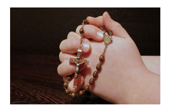
Why the Rosary?

These are names that have been processed so far. These flowers will beautify our parish in the upcoming months. Thank You.