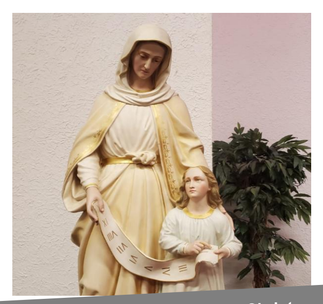
Most Holy Body and Blood of Christ June 19<sup>th</sup>, 2022

If you would like Holy Mass to be offered for your intentions or the intentions of your loved ones, please call the Parish Office, or you can write it up and drop it in the donation box in the church. Mass offering is $10.